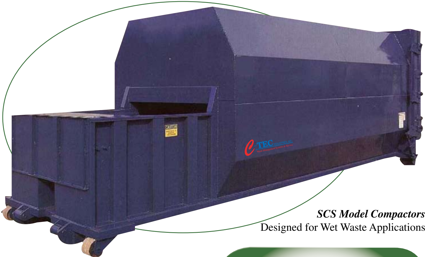
SCS Model Compactors Designed for Wet Waste Applications

Their leak-proof construction makes these units ideal for: